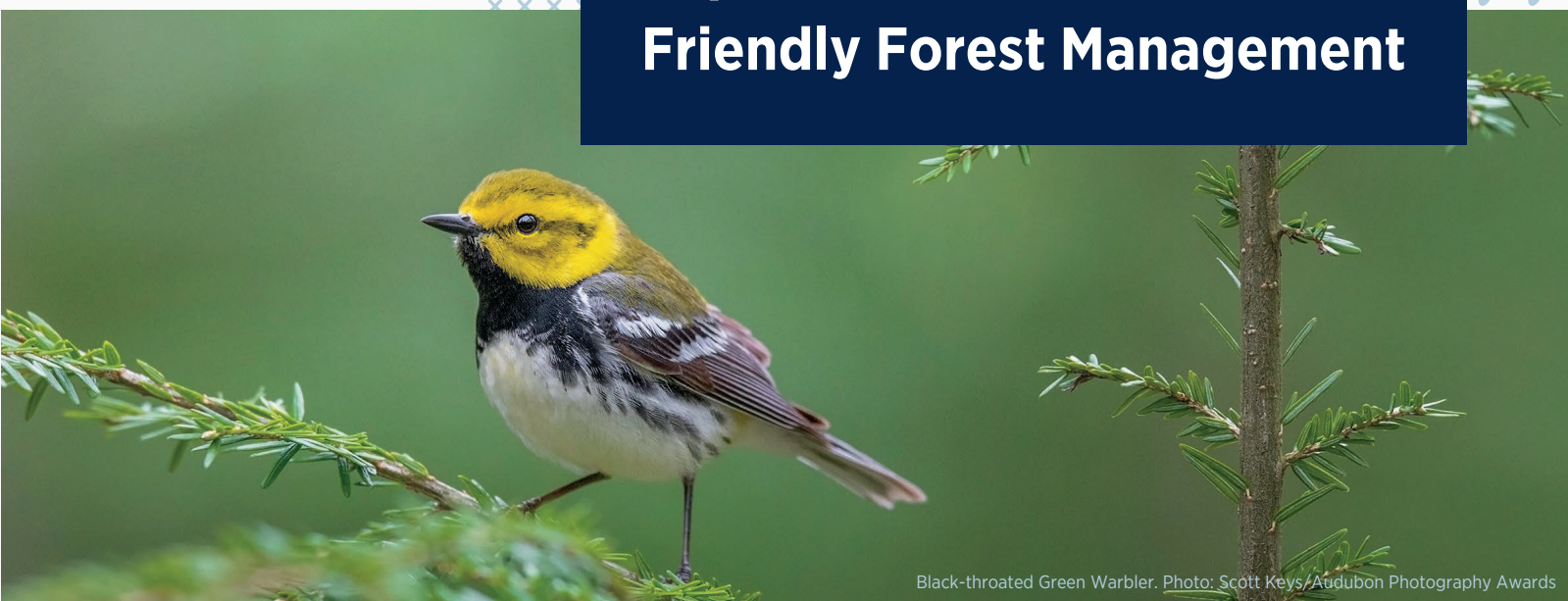
Black-throated Green Warbler.