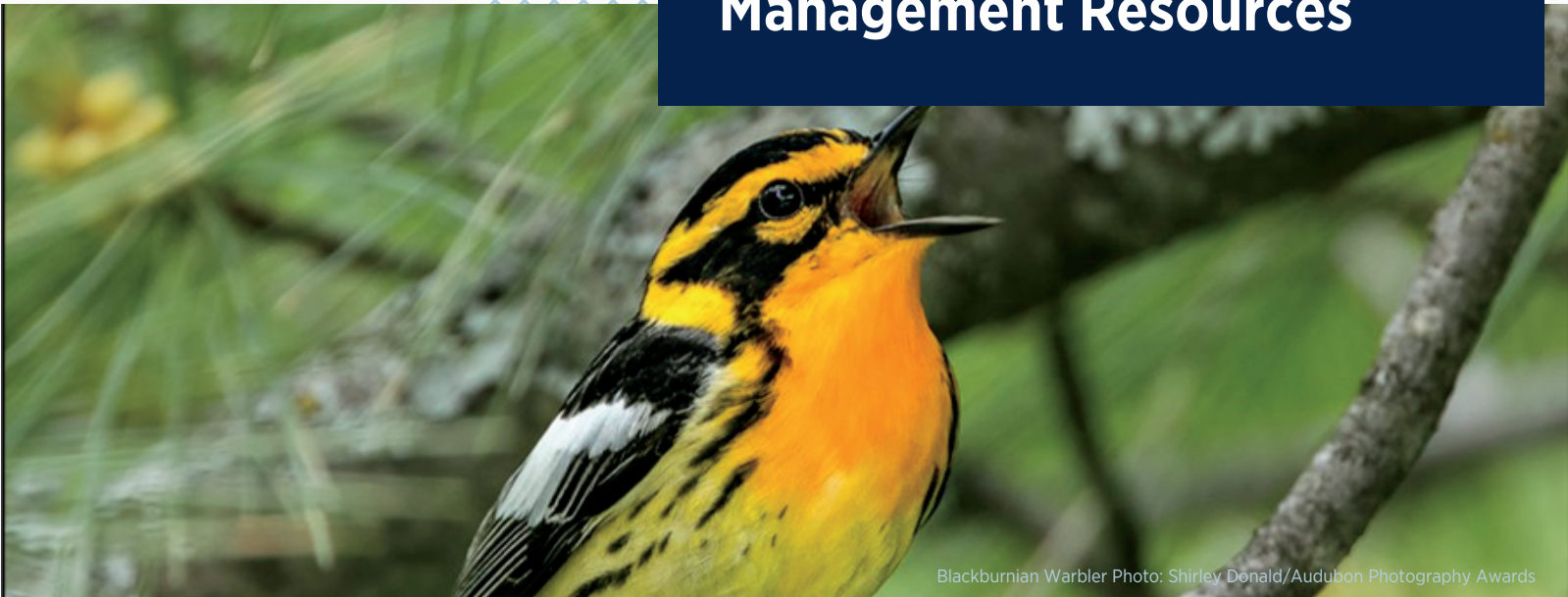
Blackburnian Warbler

Download these guides to learn how to steward your forests for birds