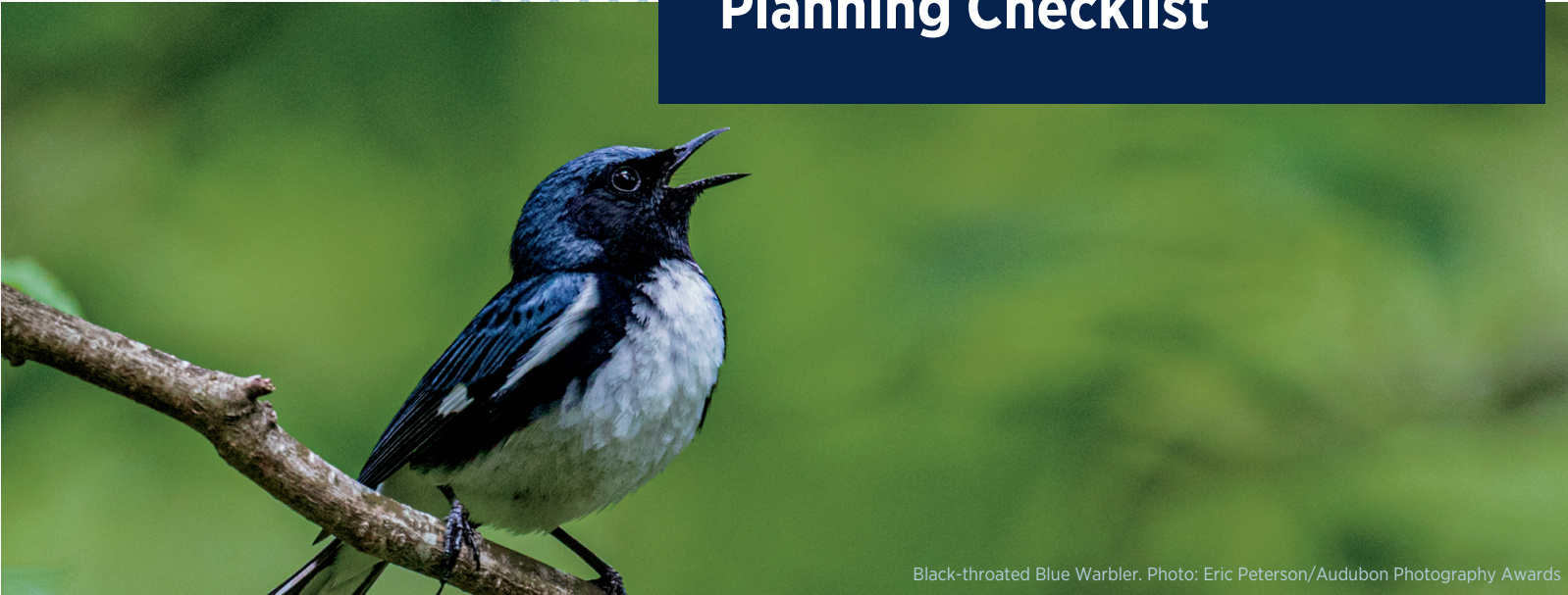
Black-throated Blue Warbler.