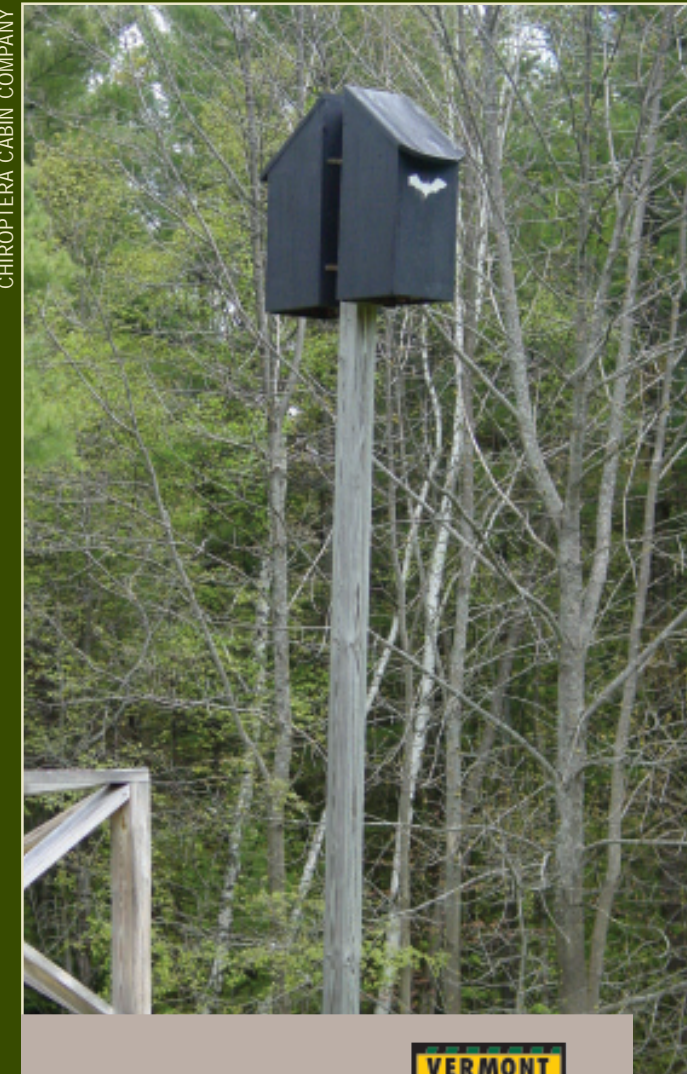
CHIROPTERA CABIN COMPANY